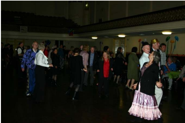
Happy dancers kicking up their heels