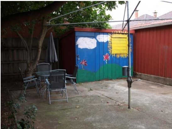
Mother and child relaxation area at Good Samaritan Inn