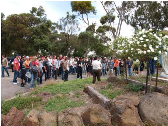
Corpus Christi Community – part of main group receiving instructions